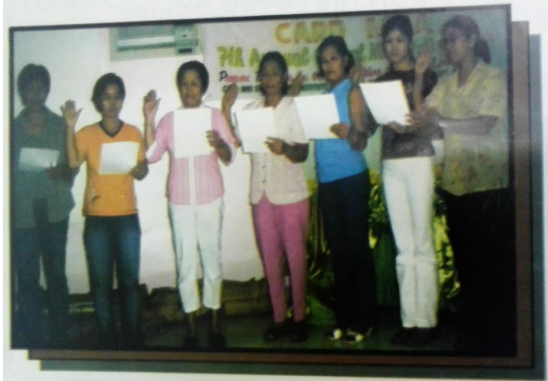
Annual General Membership Meeting (7 th AGMM) September 9, 2006 in Bay, Laguna