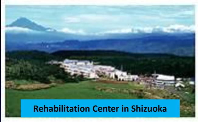
Rehabilitation Center in Shizuoka

Hospitalization : 110 beds Training facility for disabled : 134 patients Rehabilitation : 100 patients Staff : 371