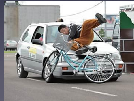
Simulated experience education with demonstration of stunt men for junior high and high school students (since 2009)