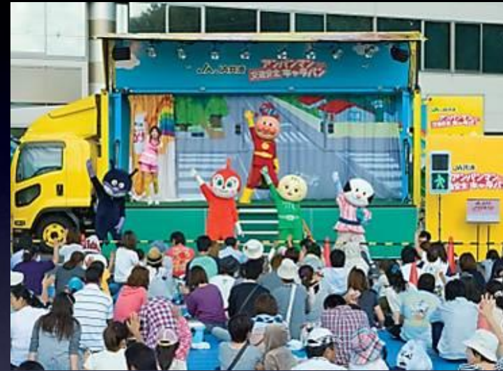
Caravan play for preschooler (since 2010)