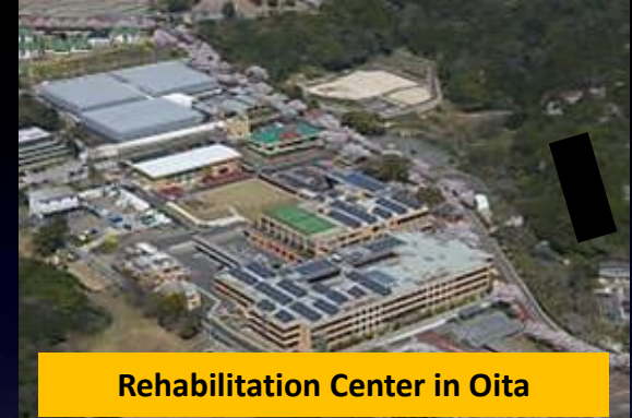
Rehabilitation Center in Oita

Hospitalization : 116 beds Training facility for disabled : 80 patients Rehabilitation : 130 patients Staff : 293