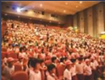
Musical for preschooler (since 2004)