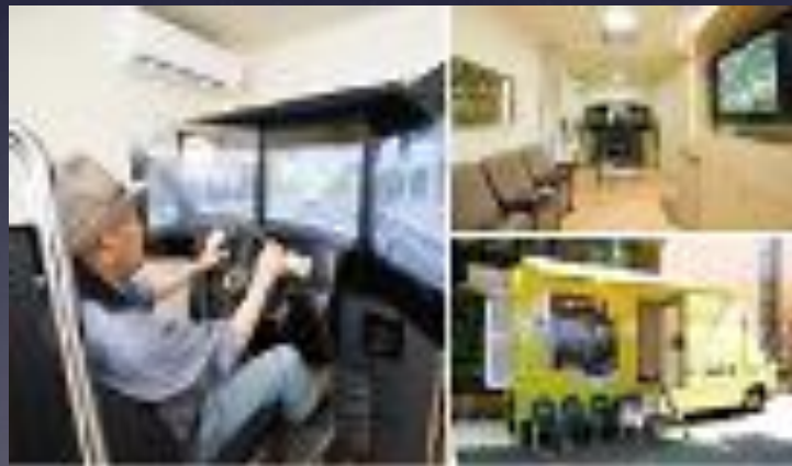
Driving Simulator (since 2008)