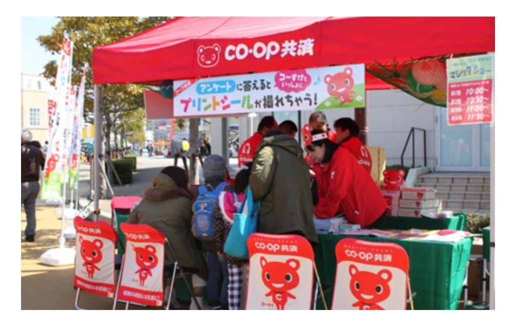
TOP A Zenrosai Pitt character at a local event MIDDLE Zenkyoren's Hitonowaguma character at a JA Kyosai Volleyball Competition BOTTOM JCIF's Ko-suke character seen at a community event