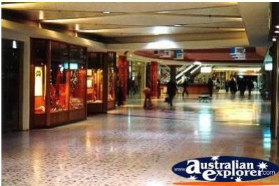
Link to Image Source

On the corner of Market and Elizabeth Streets you will find the country's most prestigious department store - David Jones. Be sure to stop at their equally renown 'Food Glorious Food' Department. You can choose from one of their many gourmet delights and then stroll over to the beautiful Hyde Park for a picnic.