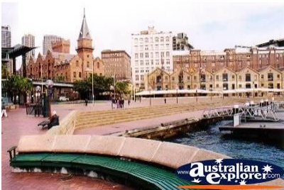
The Rocks Link to Image Source

The city is divided into North and South by the Sydney Harbour , with both Sydney Harbour Bridge and Tunnel connecting them. Most of the tourist attractions are in the South part of the city, with a large business and residential area in the North.