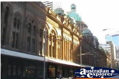
Queen Victoria building

Sydney's Central Business District is home to some of the best shopping centres in the city. There is something for everyone with over 400 specialty stores in just 8 retail centres. Pitt Street Mall is where you will find the popular re-branded Myer Store.