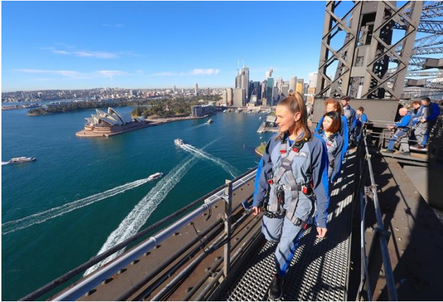
Sydney Harbour Bridge Climb Visit their website