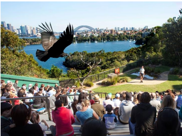
Taronga Zoo – take a tour of Sydney’s iconic zoo Visit their website