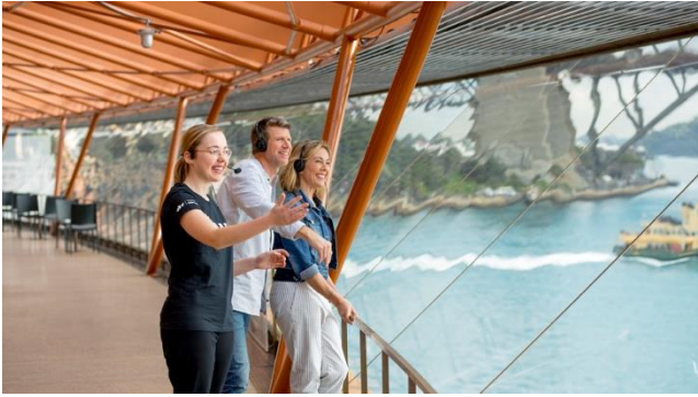
Sydney Opera House Guided Tours Visit their website