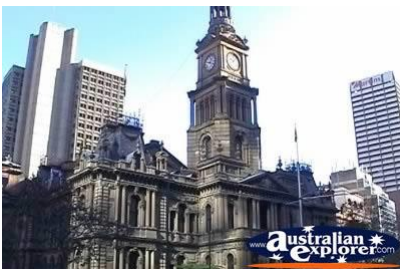
Sydney Town Hall

Don't miss the chance to shop in the famous Queen Victoria building. This stunning shopping centre occupies an entire city block. Initially completed in 1898, the Queen Victoria was restored during the 1970's and is now home to a huge array of boutiques and designer stores.